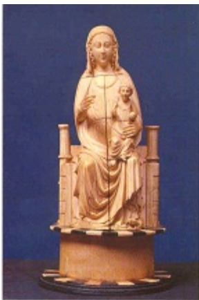
Figure 3. Virxe Abrideira of Allariz (closed).

When visualizing the image of Costanza as a beautiful altarpiece that enfoldes the hagiographical narrative of her mother, one may be reminded of the images of the Virgenes abrideras (opening Madonnas) of Gothic pre-modern style. These rare examples of ivory are very much like many other statuettes of the Madonna, but are special in that they can be opened, like the