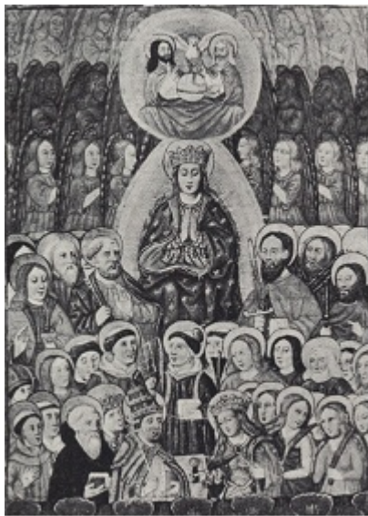
Figure 1. Anonymous, Queen of All Saints (1500s). Book of Hours, Monastery of Guadalupe (Trens 388, figure 260).

tributes. Her most eligible admirer, the son of the Corregidor , serenades Costanza with a song honoring her beauty and virtue that could be easily mistaken as a Marian hymn. The song proclaims: “deja el servir, pues debes ser servida / de cuantos ven sus manos y sus sienes / resplandecer por cetros y coronas” (154). It is not surprising, then, that Avendaño awakens from his sleep, believing the music is sung for the shrine of Our Lady del Carmen, and he surmises that “es ya de día y que debe de hacerse alguna fiesta en un monasterio de Nuestra Señora del Carmen que está aquí cerca, y por eso tocan estas chirimías” (153). The musician pronounces Costanza to be in the highest regal position, above all nobility—both worldly and heavenly. Such a description is reminiscent of Gothic artistic representations of the Regina sanctorum omnium . An example can be seen in an anonymous work from the end of the fifteenth century entitled Madonna of the Catholic