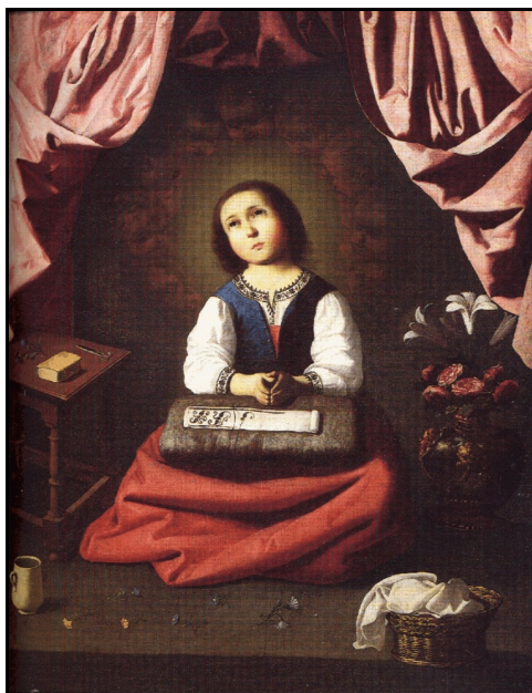
Figure 2. Zurbarán, Young Virgin (c. 1632–33). Oil on canvas. The Metropolitan Museum of Art, New York.

life and can fling open the gates of paradise” (Warner 289). Finally, the cord of Saint Francis, which she wears around her waist, alludes to her temperance, and self restraint (Ferguson 283). It also reminds us of the Marian devotion to La divina peregrina established by the order of Saint Francis.